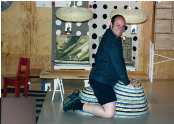
One of the secrets to Schauplatz International's success: Everyone can be the boss at his turn.

"I like sitting on my camel best," says the performance artist who just came home from a big Schauplatz International tour in the Near East. He loves his practical trophies from all over the world.