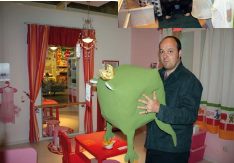
"My colour consultant didn't like this frog. We educate our children with the great true fairy tales written by the Brothers Grimm," the father of three children admits defiantly.