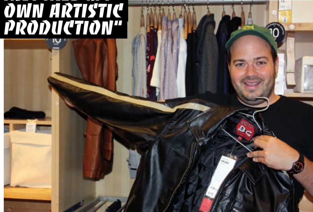
"Since I live in Berlin I've become a real fashion victim . Here is a leather jacket from a young Israeli designer from Neukölln."