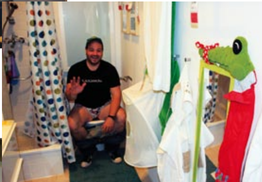
Always up for fun!