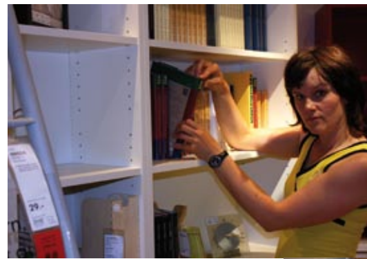
Her father’s valuable library had to come with them to Berlin. He was an actor at the Vienna Burgtheater and still is her most important critic.